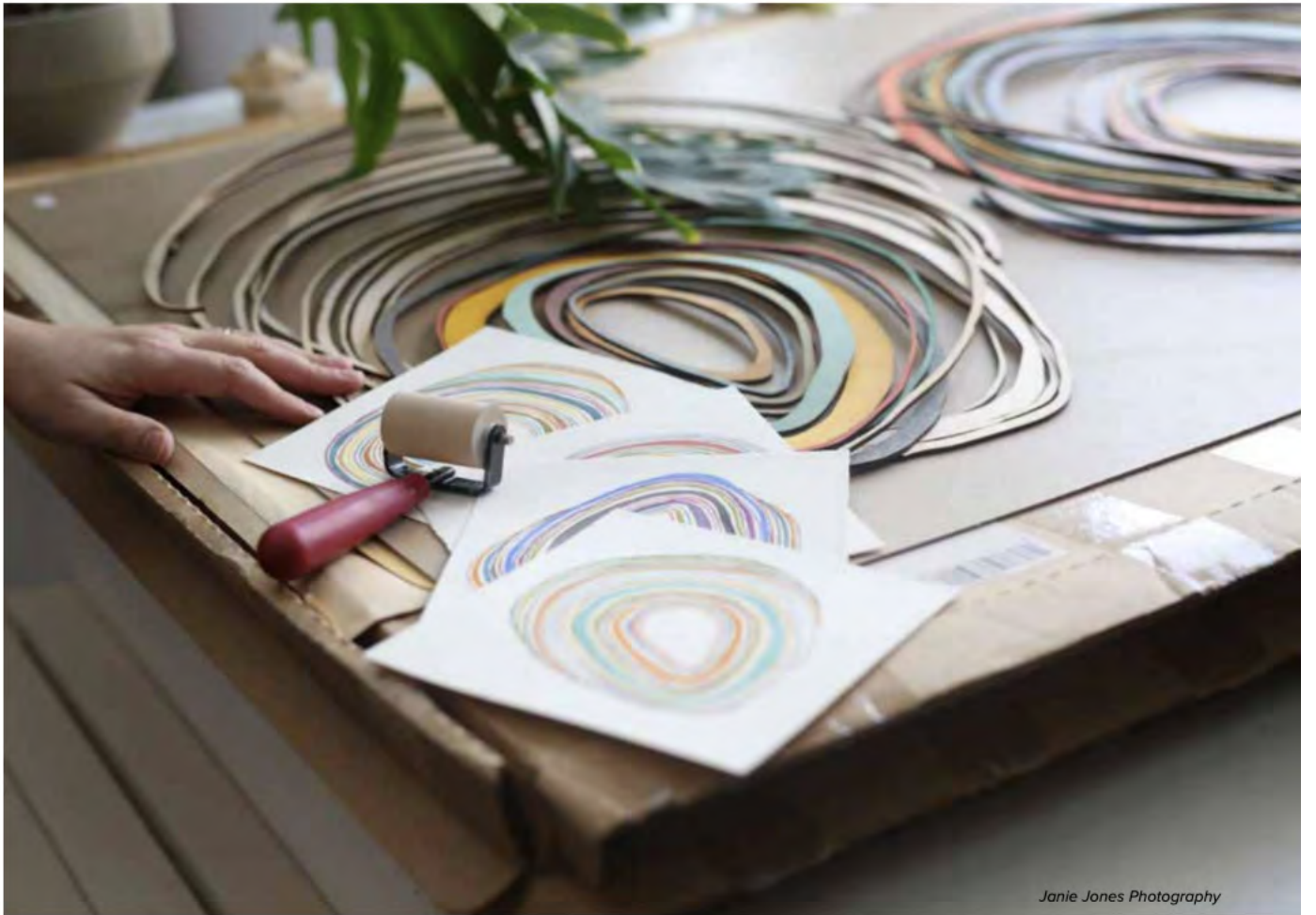
Janie Jones Photography